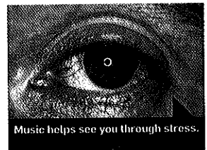
Music helps see you through stress.

ADVANTAGE: WOMEN Level the playing field: Develop a gratitude habit. Thank three people each day, even for trivial things.