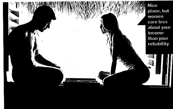
Nice place, but women care less about your income than your reliability.

mate characteristics, a man's financial prospects ranked 10th, behind emotional stability and desire for a home and family, among others. Dead last for men and women: chastity. In 1939, it ranked 10th.